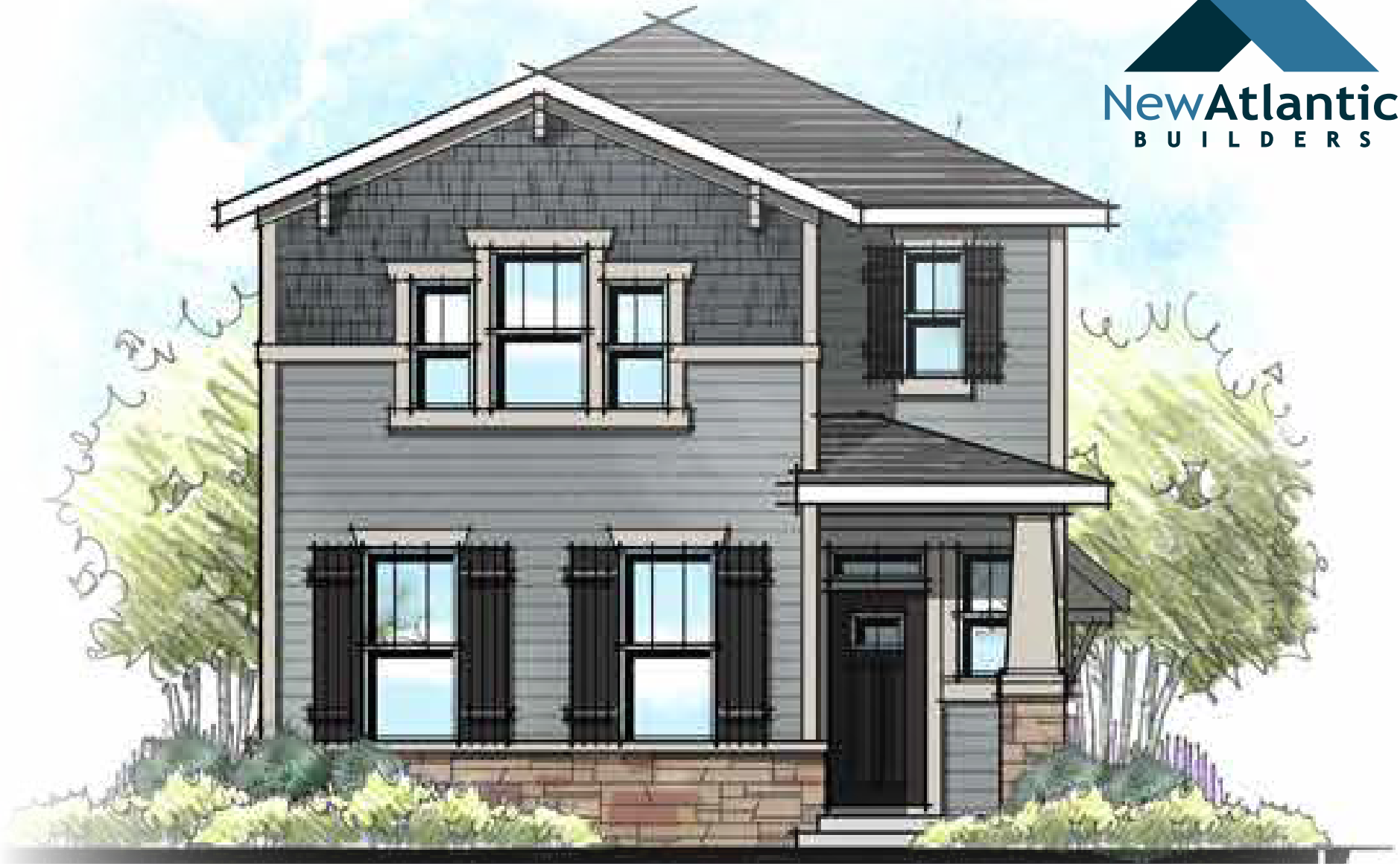
ELEVATION A - CRAFTSMAN

FLOOR PLAN AND RENDERING ARE FOR CONCEPTUAL PURPOSES ONLY. DIMENSIONS AND OTHER INFORMATION ARE APPROXIMATE AND SUBJECT TO CHANGE. 01/23.