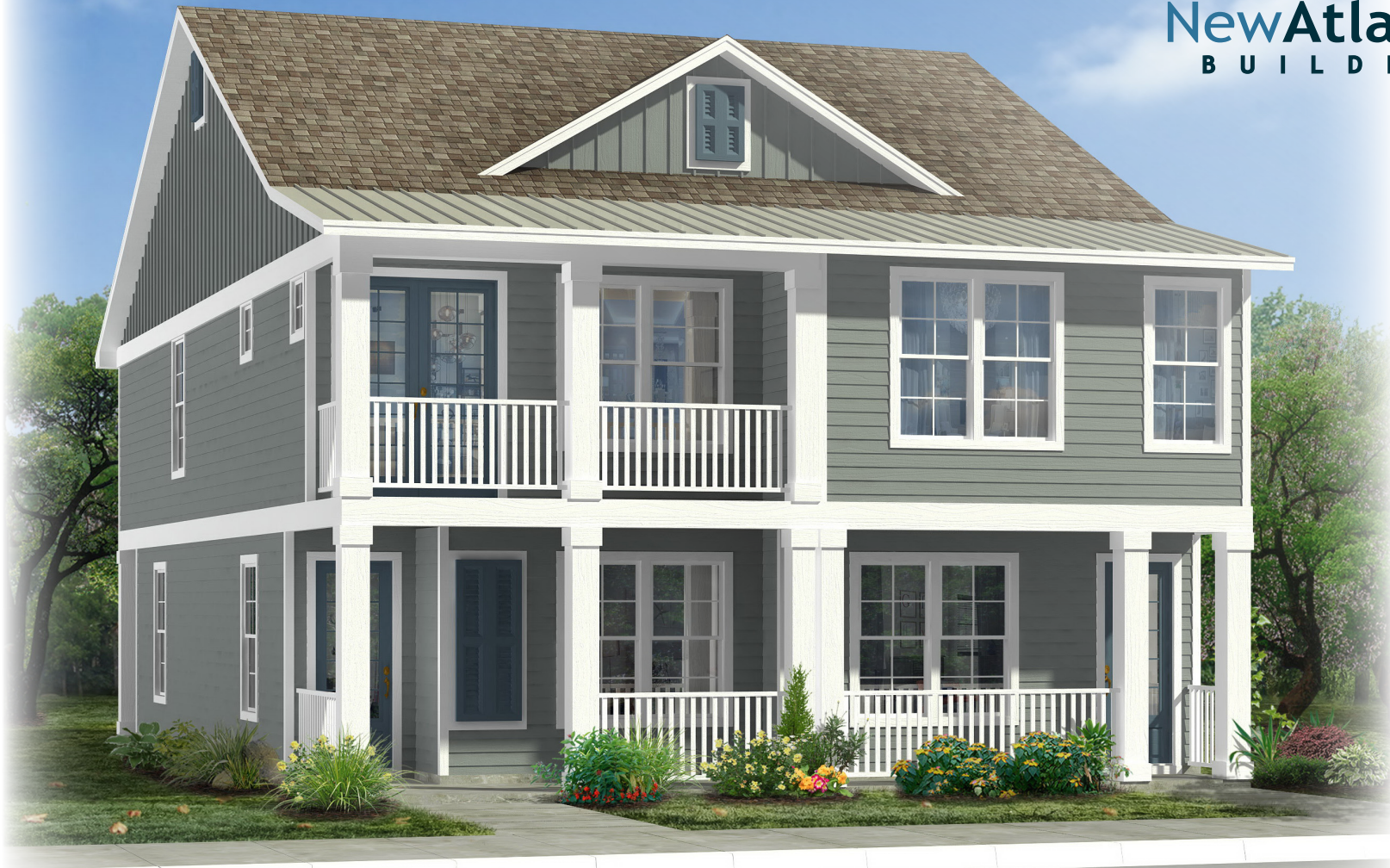
ELEVATION - 1228