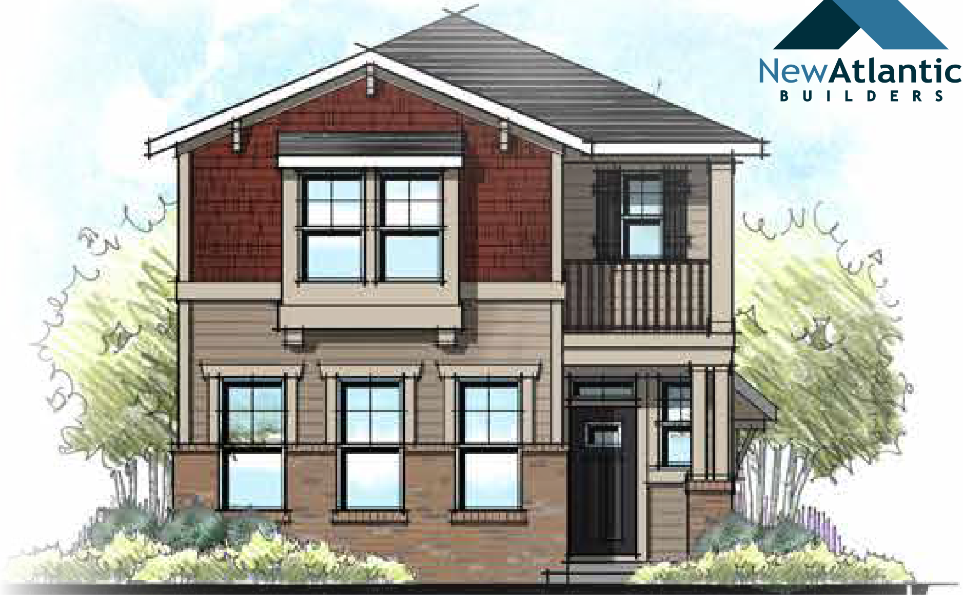
ELEVATION B - CRAFTSMAN

FLOOR PLAN AND RENDERING ARE FOR CONCEPTUAL PURPOSES ONLY. DIMENSIONS AND OTHER INFORMATION ARE APPROXIMATE AND SUBJECT TO CHANGE. 01/23.